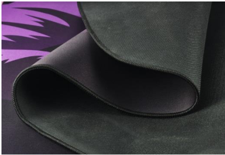
Anti-slip Rubber Base