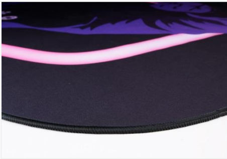
Durable Smooth Nylon Bend