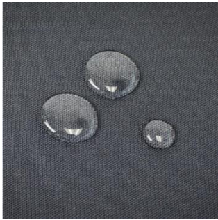
Splash Proof Coating